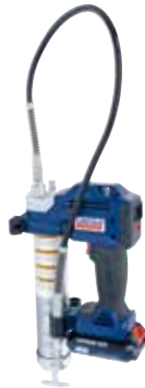
20 V Li Ion PowerLuber Model 1882

Lincoln's PowerLuber family includes a full range of battery-operated grease guns, including NiCad and Lithium-ion-powered tools, as well as pneumatic and electric options. Developed by the lubrication experts, the PowerLuber line has the right grease gun for your needs.