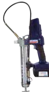
18 V Li Ion PowerLuber Model 1862