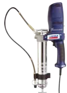
120 V AC PowerLuber Model AC2440