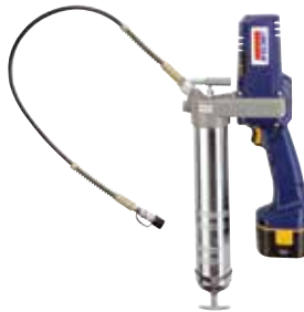
12 V PowerLuber Model 1242