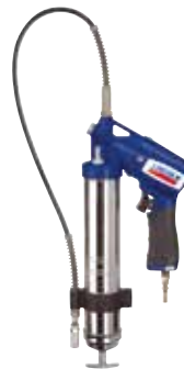
Pneumatic PowerLuber Model 1162