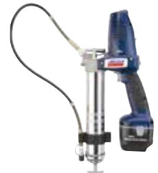
18 V NiCad PowerLuber Model 1842